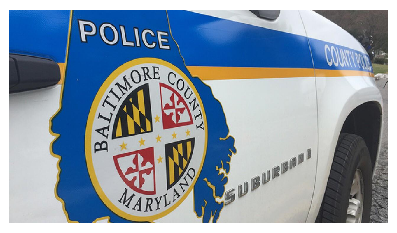
Baltimore County Police Department

In May of 2021, the White Marsh and Essex experienced Precincts six carjacking incidents, which all occurred in apartment complexes. Several of the vehicles taken were later recovered in Anne Arundel County. During this time, Anne Arundel County also experienced two carjackings. Eventually, three suspects were arrested and charged and confessed to several of these carjackings. Additionally, Anne Arundel County linked these suspects to their cases.