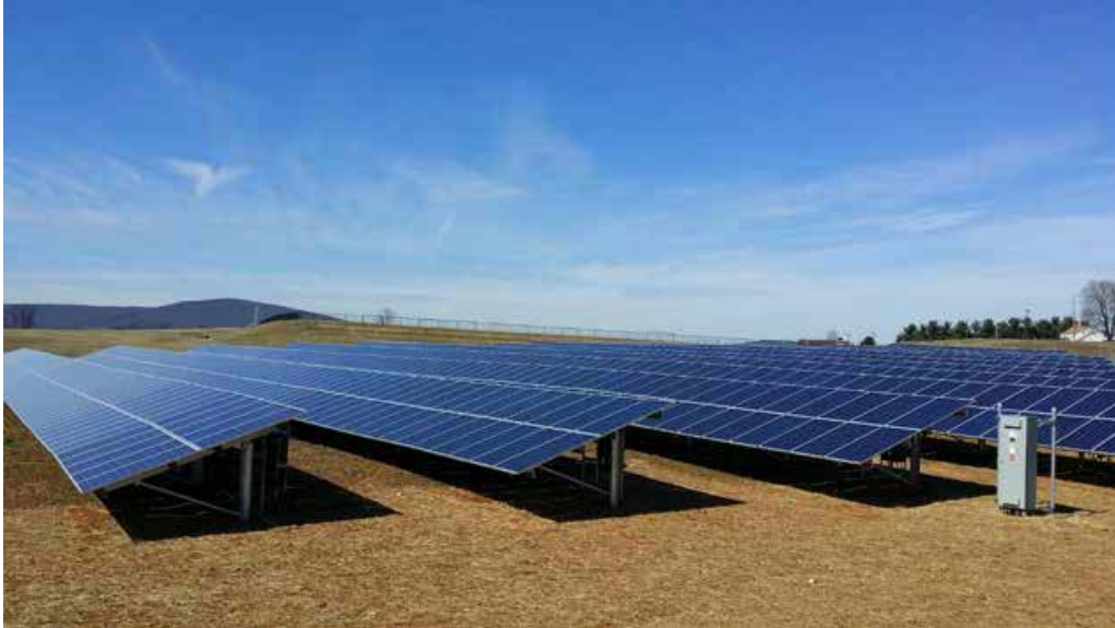
(Installation of typical ground-mounted solar panels in Middletown, Maryland)