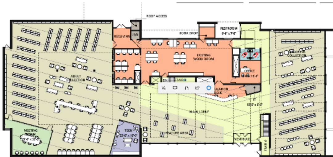
1 UPPER LEVEL FLOOR PLAN - BASE OPTION 1/16" = 1'-0"